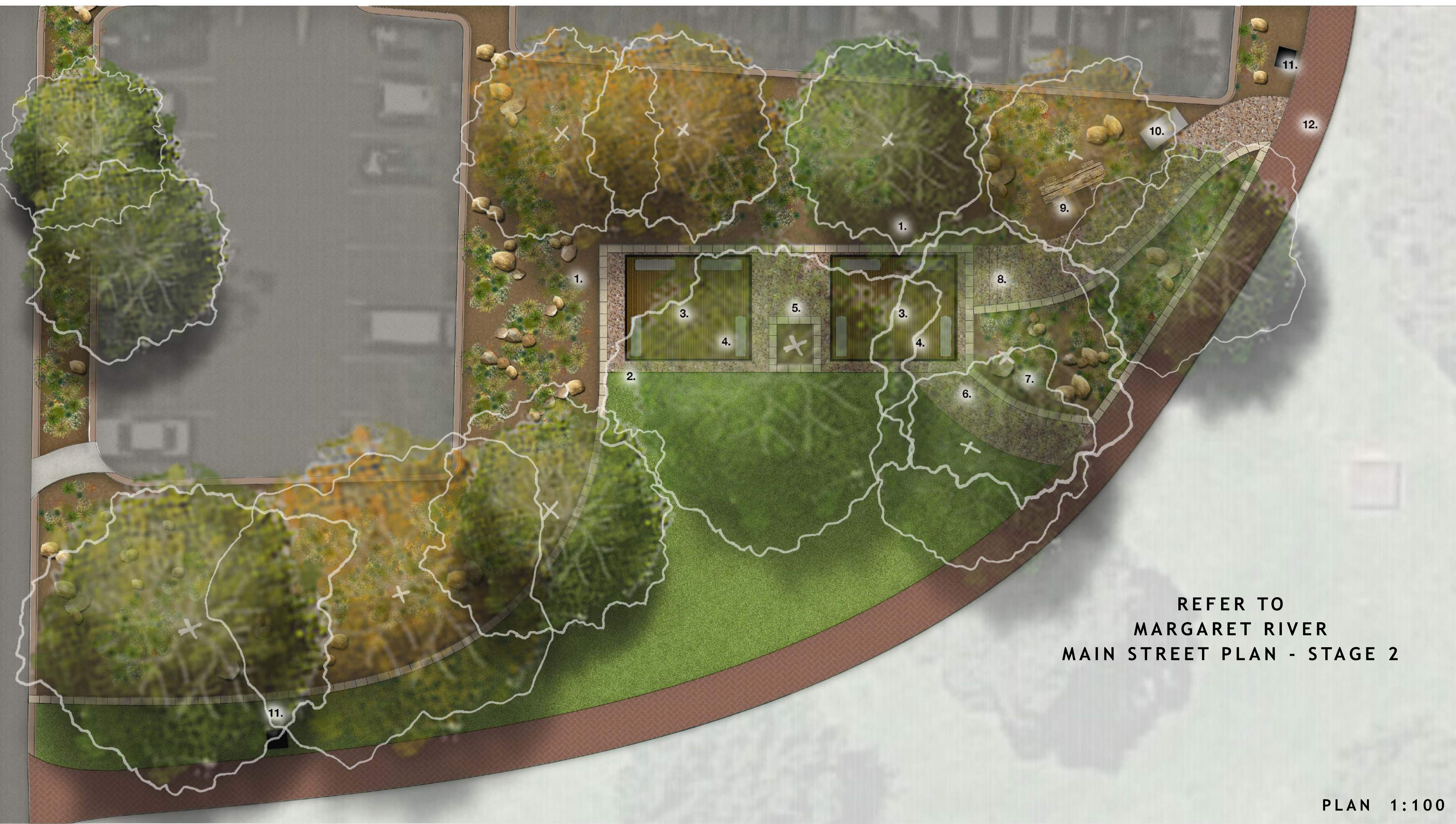
REFER TO MARGARET RIVER MAIN STREET PLAN - STAGE 2