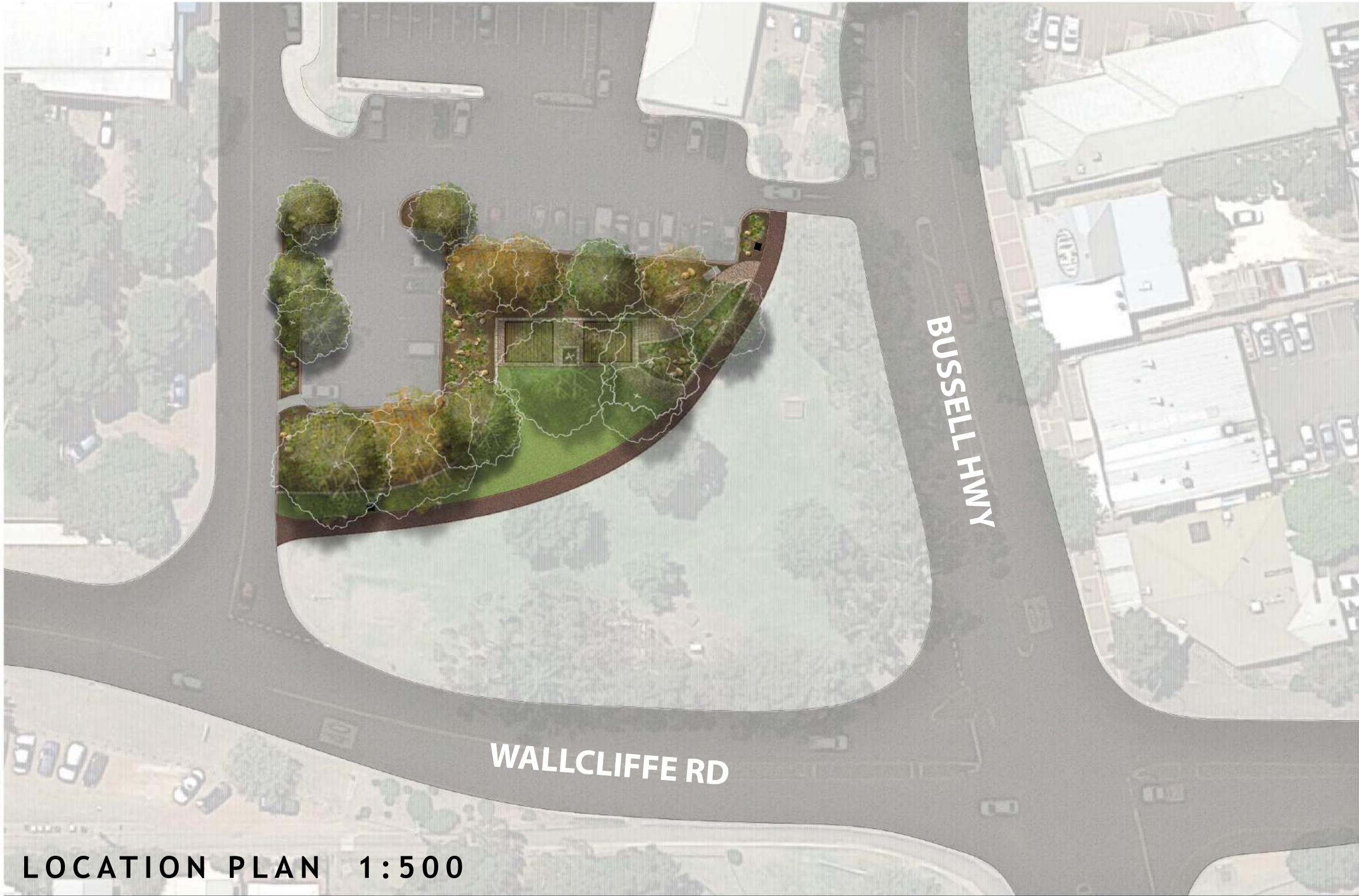
LOCATION PLAN 1:500